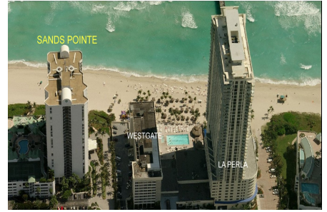
Built in 1996 - 212 units - 28 floors

Sands Point Condominium Association Inc (305)947-8881 & (305) 947-4218