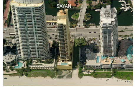
Built in 2007 - 90 units - 29 floors

Sayan Condominium Association, Inc (305) 503-0520