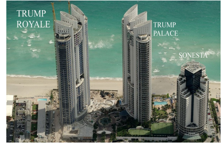
Built in 2008 - 384 units - 55 floors