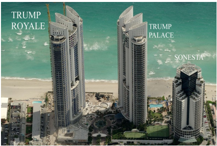
Built in 2008 - 384 units - 55 floors