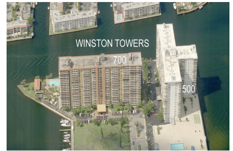
Built in 1980 - 391 units - 23 floors

Winston Tower 700 Condominium Association (305) 931-5998 & (305) 935-0670