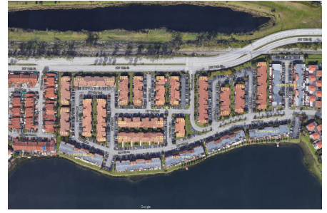
Built in 1996 - 234 units - 2 floors