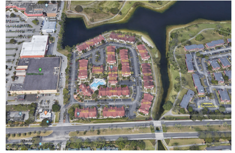
Built in 1991 - 240 units - 2 floors

Coral Club Garden Villas 15091 SW 103 Lane Miami, FL 33196 (786) 447-0843 Condominium Association