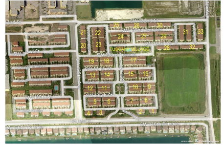
Built in 2005 - 324 units - 2 floors

Tuscany Village HOA Inc 12801 SW 133 St Miami, FL 33186 Phone: (305) 251-1149