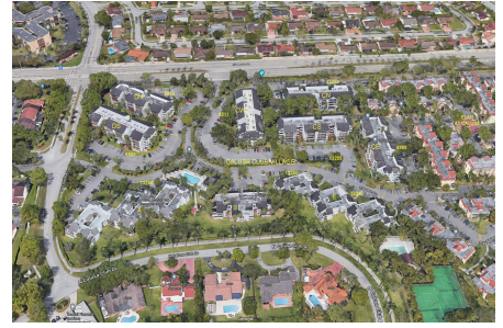
Built in 1983/1986 - 276 units - 4 floors

Calusa Club Village Property Owners 14275 SW 142nd Ave Miami, FL 33186 (305) 253-7977