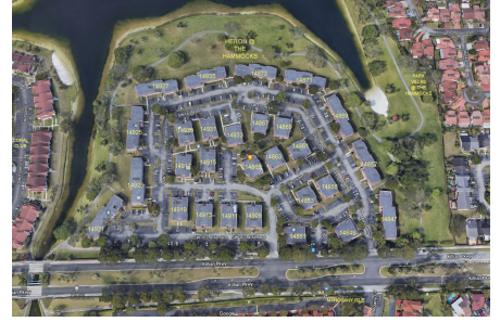
Built in 1982 - 264 units - 2 floors

Hammocks Community Association Address: 9020 Hammocks Blvd, Miami, FL 33196 Phone: +1 305-382-3999 https://www.hammockscommunityassociation.com/