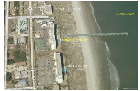
Built in 1973 - 84 units - 7 floors

Amelia Property Services, LLC 3240 S Fletcher Ave Fernandina Beach, FL 32034 Phone 904 557-3400 Fax: 904-310-3725 http://www.ameliabythesea.net/