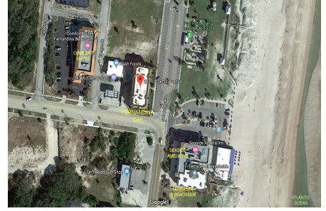
Built in 2004 - 12 units - 3 floors

Fernandina Cay Condominium Association, Inc Yulee, FL 32041 Phone: (904) 225-9070 http://www.pmsiofflorida.com