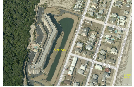
Built in 2001 - 95 units - 4 floors

Number of units: 95 Number of active listings for rent: 1 Number of active listings for sale: 0 Building inventory for sale: Number of sales over the last 12 months: 0% Number of sales over the last 6 months: 1 Number of sales over the last 3 months: 1