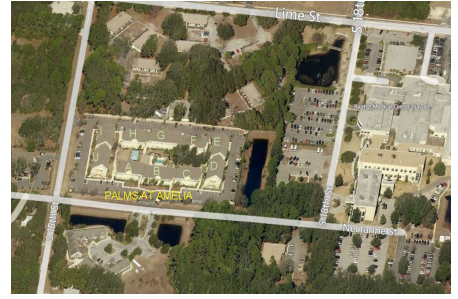
Built in 1999 - 80 units - 2 floors

Number of units: 80 Number of active listings for rent: 0 Number of active listings for sale: 0 Building inventory for sale: Number of sales over the last 12 months: 0%% Number of sales over the last 6 months: 1 Number of sales over the last 3 months: 0