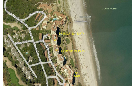
Built in 1994 - 27 units - 7 floors

Number of units: 27 Number of active listings for rent: 0 Number of active listings for sale: 0 Building inventory for sale: Number of sales over the last 12 months: 0% Number of sales over the last 6 months: 0 Number of sales over the last 3 months: 0