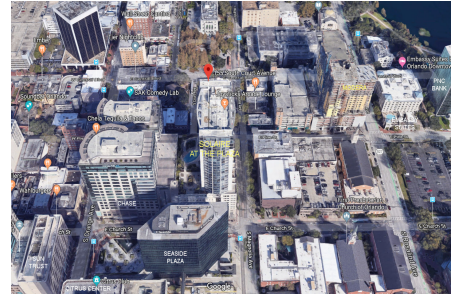
Built in 2007 - 305 units - 30 floors

Solaire Residences 155 S. Court Ave. Orlando, Florida 32801 Property Manager P: +1 (407) 373.2494 F: +1 (407) 373.2493 https://thesolaireattheplaza.com/