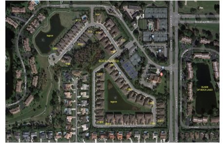
Built in 2020 - 120 units - 2 floors

Number of units: 120 Number of active listings for rent: 0 Number of active listings for sale: 3 Building inventory for sale: 2% Number of sales over the last 12 months: 4 Number of sales over the last 6 months: 0 Number of sales over the last 3 months: 0