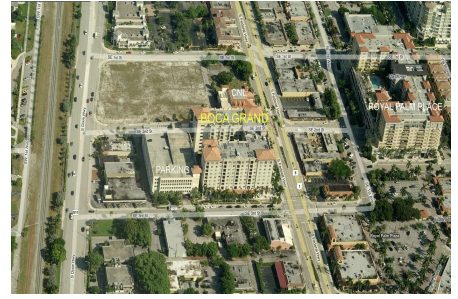
Built in 2004 - 164 units - 9 floors

Boca Grand Condominium Association, Inc 233 S Federal Highway # 101 Boca Raton, FL33432 (561) 338-2172