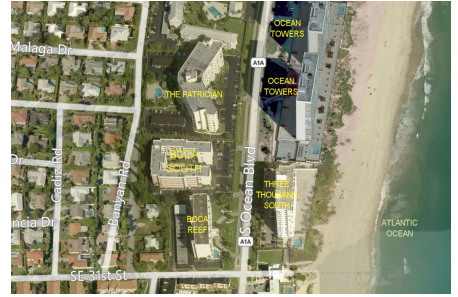
Built in 1974 - 86 units - 5 floors

Boca South Association Inc Address: 2929 S Ocean Blvd, Boca Raton, FL 33432, Phone:+1 561-395-5527