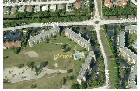
Built in 1976 - 117 units - 5 floors

Boca Teeca Condo 6 6661 NW 2nd Ave, Boca Raton, FL 33487 (561) 241-4890