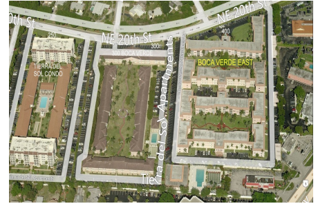
Built in 1966 - 195 units - 3 floors

Boca Verde East Condominium Association 400 NE 20th St, Boca Raton, FL 33431 (561) 391-1260 (561) 391-7507 (4300 NW 1st Avenue)