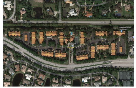
Built in 1991 - 196 units - 2 floors

THE BOCAR 3201 Clint Moore Rd, Boca Raton, FL 33496 (561) 998-3383 https://www.thebocar.com/