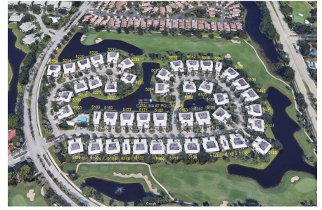
Built in 1989 - 176 units - 2 floors

Number of units: 176 Number of active listings for rent: 2 Number of active listings for sale: 9 Building inventory for sale: 5% Number of sales over the last 12 months: 16 Number of sales over the last 6 months: 9 Number of sales over the last 3 months: 5