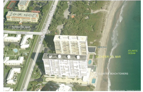
Built in 1969 - 96 units - 18 floors

Cloister Del Mar Association Inc 1180 S Ocean Blvd, Boca Raton, FL 33432 (561) 391-3260 (561) 368-1472