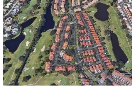
Built in 1988 - 102 units - 2 floors

Fairways Condo Association 17356 Boca Club Boulevard Boca Raton, FL 33487 (561) 241-0631