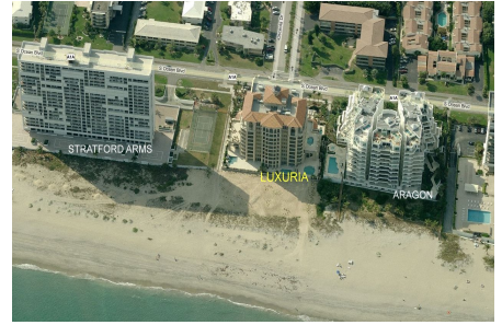
Built in 2010 - 26 units - 10 floors

Luxuria condominium association inc 2500 S Ocean Blvd, Boca Raton, FL 33432 (561) 391-1330