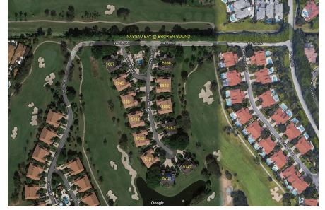
Built in 1989 - 48 units - 2 floors

Broken Sound Master Association 2701 NW 64th Blvd, Boca Raton, FL 33496 Phone: +1 561-998-5813 https://www.dnb.com/business-directory/company-profiles.community_maintenance_as