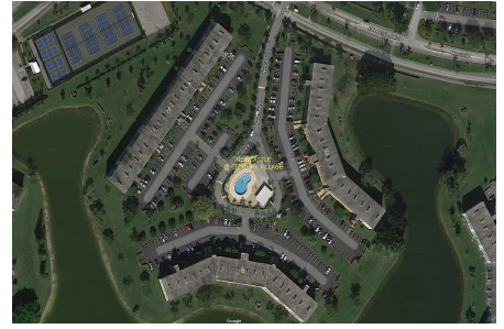
Built in 1981 - 224 units - 4 floors

Century Village at Boca Raton Address: 19296 Lyons Rd, Boca Raton, FL 33434 Phone: +1 561-451-1211