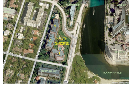
Built in 1969 - 100 units - 5 floors

Newth Gardens Association Inc Address: 1040 Banyan Rd, Boca Raton, FL 33432 Phone: +1 561-391-5262