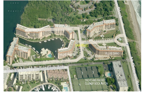
Built in 1967 - 295 units - 5 floors

San Remo Inc A Condominium 2871 N Ocean Blvd, Boca Raton, FL 33431 (561) 750-7775