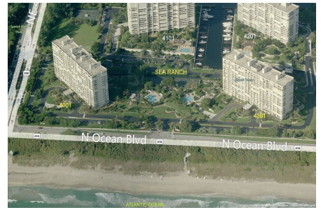
Built in 1981 - 247 units - 18 floors

SEA RANCH CLUB OF BOCA CONDOMINIUM ASSOCIATION, INC. LANG MANAGEMENT COMPANY INC PHONE 561-750-8800 FAX 561-750-4528