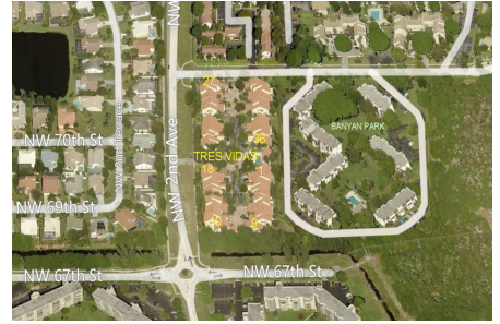
Built in 1981 - 36 units - 2 floors

Tres Vidas Condominium One Inc 6850 NW 2nd Avenue Apartment 37 Boca Raton, FL 33487 Phone: (561) 997-7987