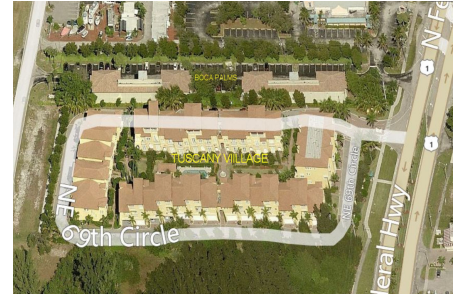
Built in 2006 - 37 units - 2 floors

Tuscany Village HOA Inc 12801 Sw 133rd St Miami, FL 33186 Phone: (305) 251-1149