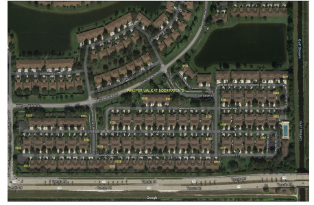
Built in 1988 - 280 units - 1 floor

Whisper Walk Property Manager Seacrest Services (561) 697-4990 http://www.seacrestservices.com/ https://www.whisperwalkinc.com/