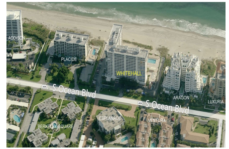
Built in 1971 - 162 units - 18 floors

Whitehall Condominium Association 2000 S Ocean Blvd, Boca Raton, FL 33432 561-391-7666