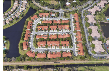
Built in 2001 - 128 units - 2 floors