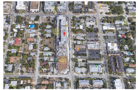
Built in 2019 - 32 units - 4 floors

236 Fifth Avenue Delray Beach Address: 236 SE 5th Ave, Delray Beach, FL 33484 Phone: +1 561-704-5559