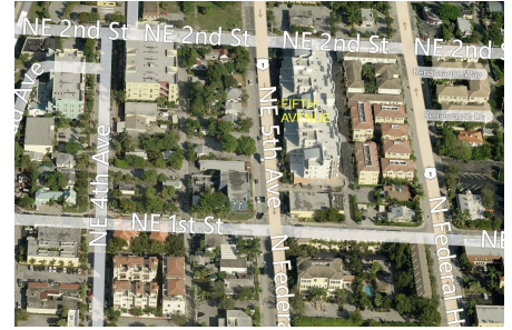
Built in 2011 - 47 units - 5 floors

5TH AVENUE AT DELRAY CONDOMINIUM ASSOCIATION, INC 190 NE 5TH AVENUE DELRAY BEACH, FL33483 Phone: 407-425-0101