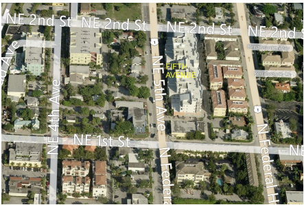
Built in 2011 - 47 units - 5 floors

5TH AVENUE AT DELRAY CONDOMINIUM ASSOCIATION, INC 190 NE 5TH AVENUE DELRAY BEACH, FL33483 Phone: 407-425-0101