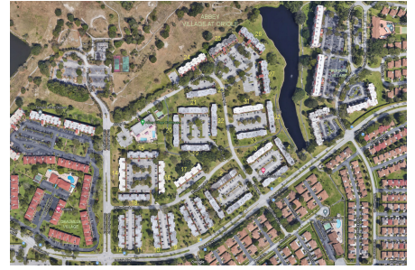
Built in 1978 - 528 units - 2 floors

Abbey Village Condominium Association, Inc Address: 6294 Abbey Ln, Delray Beach, FL 33446 Phone: +1 561-499-1438 https://www.akamfl.com/abbeyvillage/home.asp