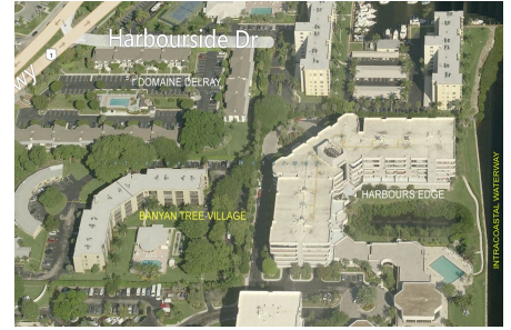
Built in 1979 - 55 units - 4 floors

BANYAN TREE VILLAGE CONDOMINIUM ASSOCIATION, INC HRT REALTY SERVICES LLC 1200 CLINT MOORE RD STE 8 BOCA RATON FL 33487 561-998-3011