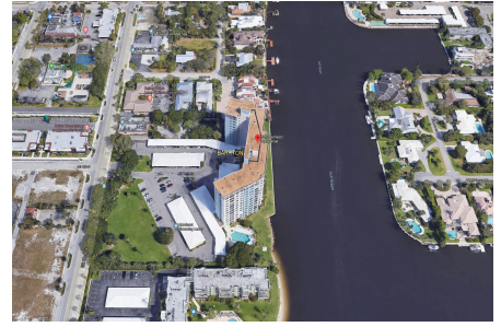
Built in 1972 - 103 units - 13 floors