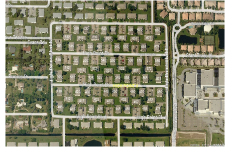
Built in 1973 - 276 units - 1 floor

Number of units: 276 Number of active listings for rent: 1 Number of active listings for sale: 3 Building inventory for sale: 1% Number of sales over the last 12 months: 5 Number of sales over the last 6 months: 2 Number of sales over the last 3 months: 1