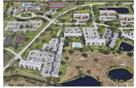
Built in 1986 - 384 units - 8 floors

Huntington Lakes Inc Address: 7355 Huntington Ln, Delray Beach, FL 33446 Phone: +1 561-498-0228 https://hlidelray.com/