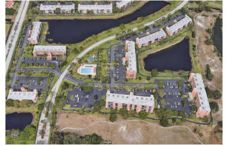
Built in 1989 - 352 units - 8 floors

Huntington Lakes Inc Address: 7355 Huntington Ln, Delray Beach, FL 33446 Phone: +1 561-498-0228 https://hlidelray.com/