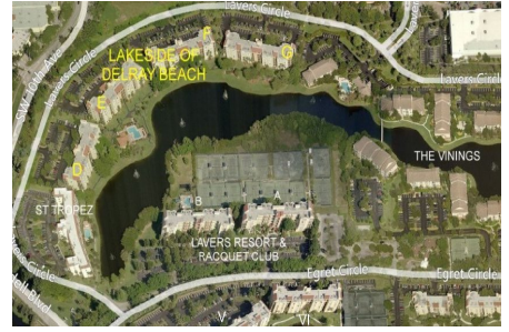
Built in 1984 - 212 units - 5 floors

Lakeside of Delray Beach 1915 Lavers Circle Suite E-106 Delray Beach FL 33444 (561) 278-8558 http://lakeside-delraybeach.com/