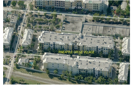
Built in 2004 - 160 units - 5 floors

Pineapple Grove Village Condo Association Inc. 245 NE 2nd Street Delray Beach, FL33444-3747 (561) 278-5395 (561) 330-0231