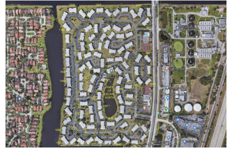
Built in 1980 - 700 units - 2 floors

Pines of Delray North Association Inc Address: 1431 NW 18th Ave, Delray Beach, FL 33445 Phone: +1 561-278-1212 https://www.pinesnorthofdelray.com/Page/23