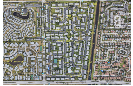
Built in 1974/1979 - 684 units - 2 floors

The Pines of Delray Association Inc 2451 Black Olive Boulevard Delray Beach, FL 33445 (561) 276-3539 https://www.thepinesofdelray.com/Page/29