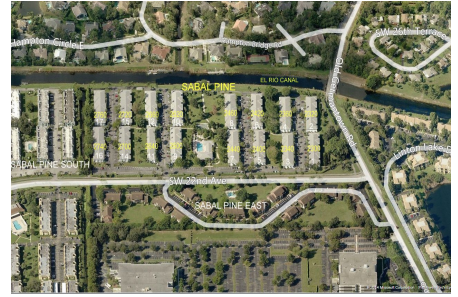
Built in 1972 - 255 units - 2 floors

SABAL PINE ASSOCIATION, INC. Florida One Management 9825 Marina Blvd. Suite 100 Boca Raton, FL 33428 Phone:561-488-4802 Fax:561-488-4420 http://www.sabalpine.com/