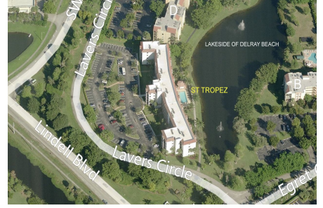
Built in 2000 - 64 units - 5 floors