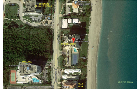
Built in 1982 - 42 units - 11 floors